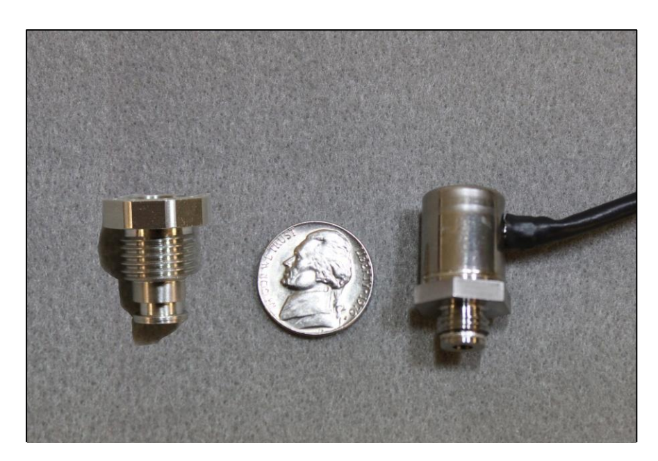
The rocket motor initiator, in conjunction with the through bulkhead initiator, is designed to work with <u>Excelitas Blue Chip</u>® Detonators and Ignition Safety Devices.

Excelitas' patented rocket motor initiators and through bulkhead initiators are designed to work in a variety of applications, including many existing applications that do not have MIL-STD-1901A-compliant initiators. The initiator is designed to work in conjunction with Excelitas' low energy, low profile Blue Chip® Detonator.