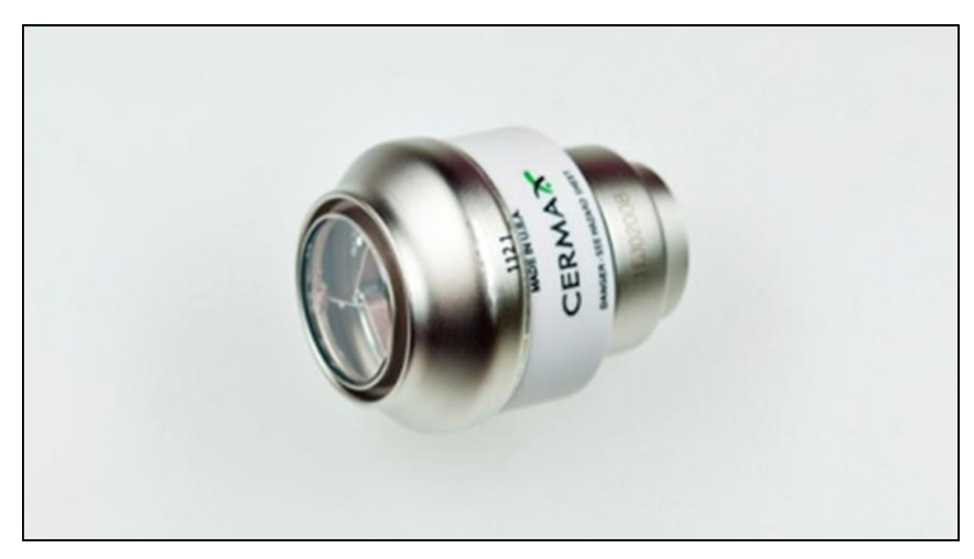
Cermax<sup>®</sup> Xenon short-arc lamps from Excelitas Technologies are ideal for applications that require a high degree of illumination control.

The Cermax® Xenon short-arc lamp from Excelitas Technologies is an innovative lamp design in the specialty lighting industry. Cermax® Xenon lamps were first introduced in the early 1980s and are now used in diagnostic and surgical endoscopes in most major hospitals worldwide, in high-brightness projection display systems, and for a wide variety of high-performance applications.