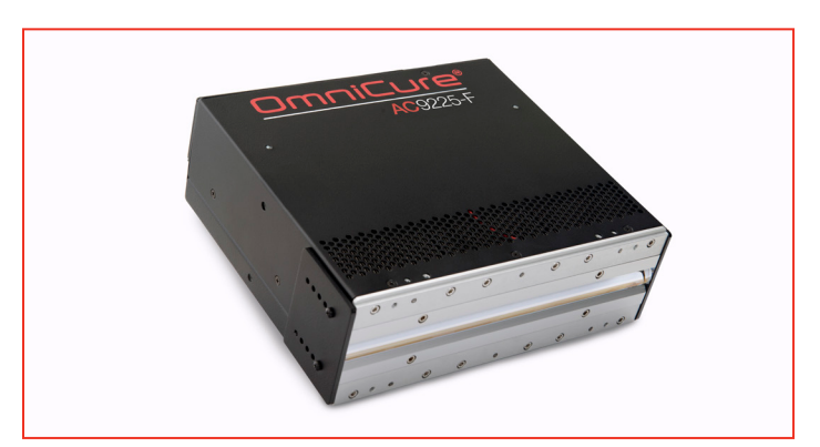
FIGURE 2: OmniCure AC9225-F with custom focusing lens for fiber curing applications.

UV LED systems, such as the OmniCure AC9225-F, (see figure 2) can provide an alternative or a complement to current UV arc lamp-based curing systems in fiber optic manufacturing processes. These systems can be used in a number of configurations depending on the manufacturing process and coating material. One cost-effective configuration involves replacing each UV lamp-based system and reflector mirror with one or more sets of OmniCure AC9225-F systems, with focusing lenses facing each other to achieve a uniform UV intensity at the fiber (see Figure 3).