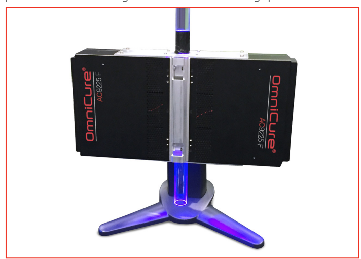
FIGURE 3: A set of OmniCure AC9225-F UV LED curing systems in a face-to-face configuration.

For a "wet-on-wet process", optical shadowing of the primary coating by the secondary coating may lead to slower draw speed or the requirement for an increased number of UV LED systems. Further testing with different and improved formulations of primary coatings may be able to eliminate the problem of shadowing and allow faster throughput.