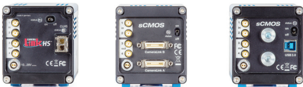
Figure 2: Same model of an sCMOS camera with three different image data interfaces. From left to right: Camera Link HS, Camera Link (full) and USB 3.0.

ly 40 MB/s of bandwidth sufficient for small-resolution cameras. One of the greatest advantages of USB 2.0 is its widespread availability as the main interface for consumer computer peripherals like keyboards, printers, and scanners. Most desktop and notebook computers come with USB as a standard interface. In 2008, USB technology took a major step forward with USB 3.0 (later called USB 3.1 Gen 1, see fig. 1 [e] & [i], fig. 2 right camera and fig. 3 [f]). This latest USB interface supports a data bandwidth of nearly 450 MB/s and an additional delivery of power via cable up to 15 W, enabling high-performance single-cable cameras. New capabilities with USB 3.2 allow for power supplies up to 100 W and a bandwidth of approximately 1800 MB/s.