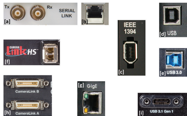
Figure 1: Photos of a variety of image data interface connectors: [a] proprietary highspeed serial data interface based on coaxial cables, [b] proprietary highspeed serial data interface based on LAN cables, [c] IEEE 1394 a “Firewire” interface, [d] USB 2.0 interface (device side), [e] USB 3.0 interface (device side), [f] Camera Link HS interface, [g] Gigabit Ethernet interface, [h] Camera Link Full interface and [i] USB 3.1 Gen 1 interface.

However, as camera technology continued to advance, it became necessary to develop a new digital data interface that surpassed the speed and performance of Firewire. In the late 1990's, National Instruments (NI)