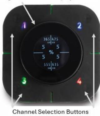
Rotating Centre Dial & Display Screen