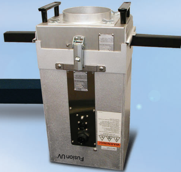
Model C10-1 shown with the I600M lamp module.