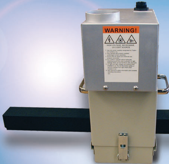
Model C6-2 shown with the I301M lamp module.